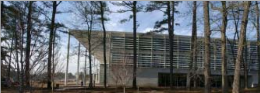
State of Georgia Archives and History Museum Morrow, Georgia

213 East Broad Street Greenville, SC 29601 Tel: 864.331.1201 Fax: 864.331.1070 www.mmsainc.com